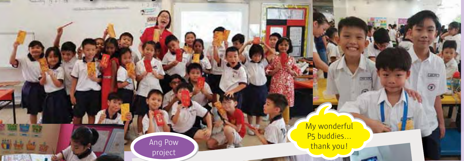
Ang Pow project