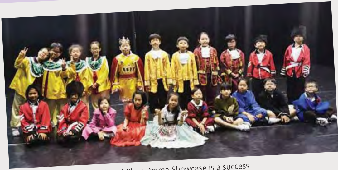
Yay! P3 Bicultural Class Drama Showcase is a success.