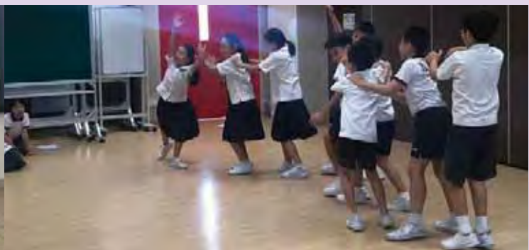
Warming up for drama lesson is so much fun!