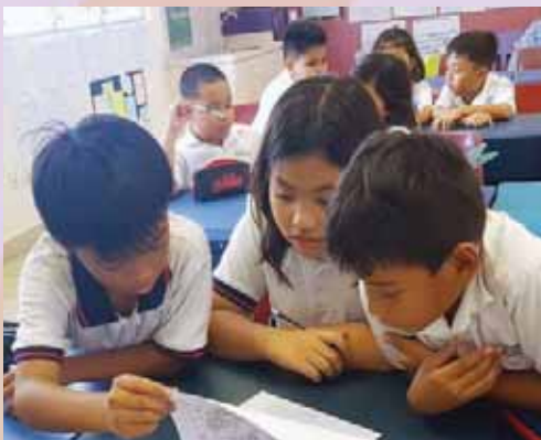
Let's put our heads together!