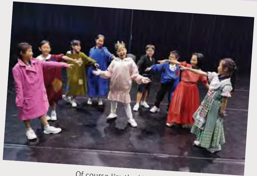
Of course I'm the king!