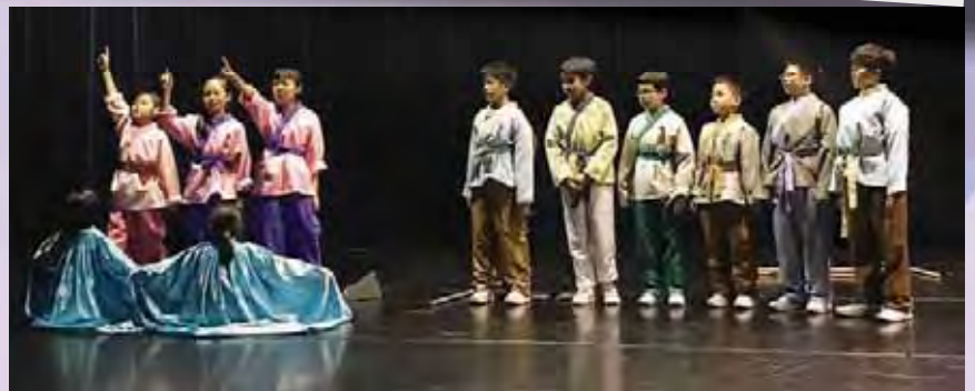
All dressed and ready for our drama showcase!