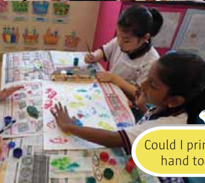
Could I print my hand too?