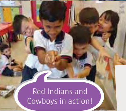
Red Indians and Cowboys in action!