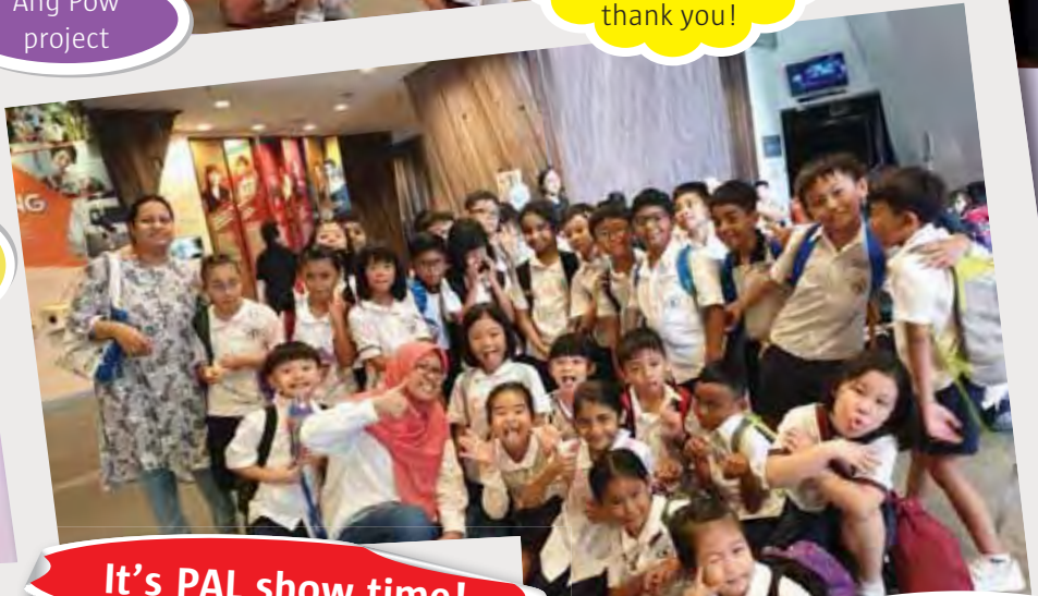
It's PAL show time!