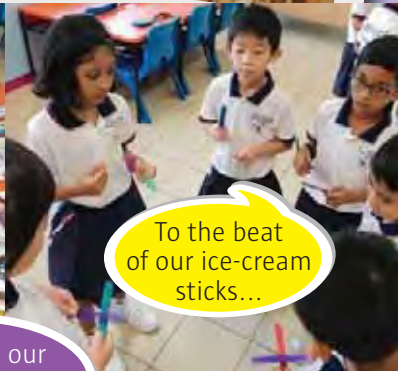
To the beat of our ice-cream sticks...