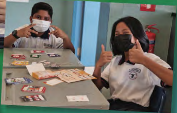
Having fun with the SG Unite game cards