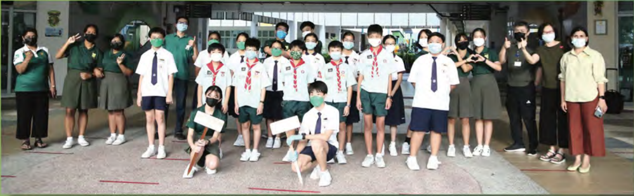
Two community schools working together to commemorate Earth Day 2022

In conjunction with the Earth Day Celebrations, our school and Tampines Secondary School organised a joint tree-planting event on 22 April 2022. The first of its kind, this event also marked the start of the collaboration between both schools in working together on the Eco Stewardship Programme to inculcate a deeper sense of environmental consciousness in the students.