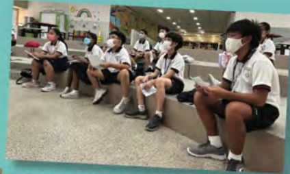
Reflection after the activities