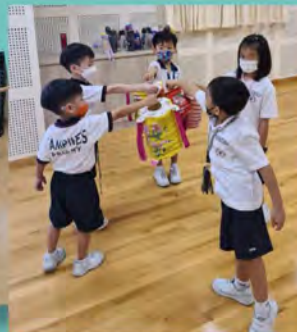
Dancing with beautiful lanterns