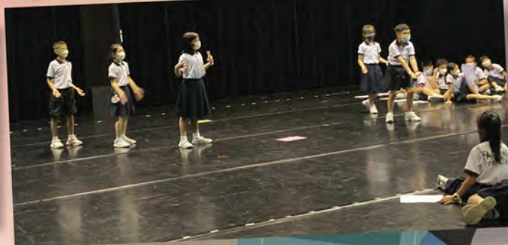
Learning to act in front of an audience