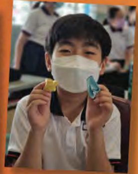
Making fortune cookies