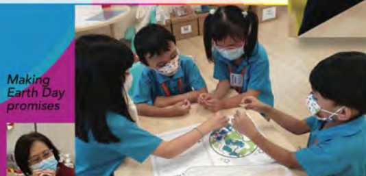
Making Earth Day promises