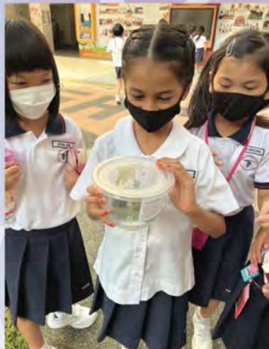
Excited to release a butterfly