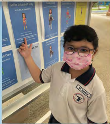
I can remember the Cyber Wellness Pledge