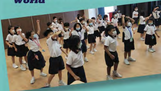
Better when we're dancing