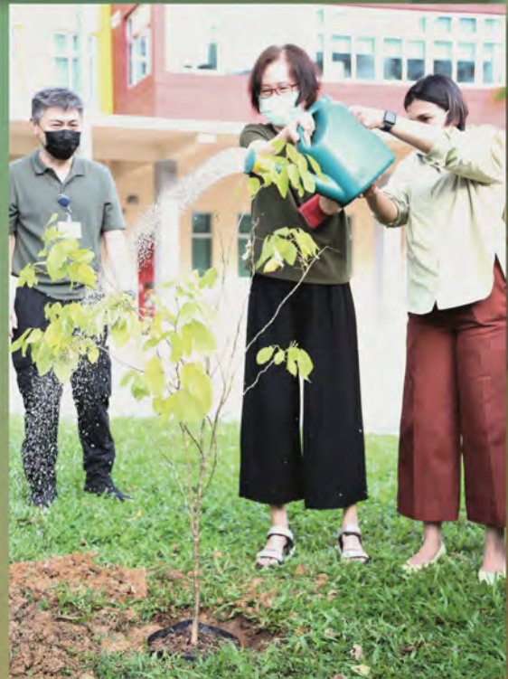
A young tree nurtured by our school leaders

MOE launched the Eco Stewardship Programme for schools in 2021 as part of Singapore's Green Plan 2030. The four key thrusts of the programme are: Curriculum, Campus, Culture, and Community – the "4Cs". Tampines Secondary School is one of the pilot schools on this programme and the collaboration between both schools will provide more platforms to share resources, build more partnerships and create more opportunities for the students to connect with nature in different ways and learn the right habits.