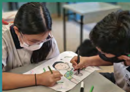
Working as a team