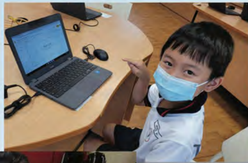
I think I've got it!