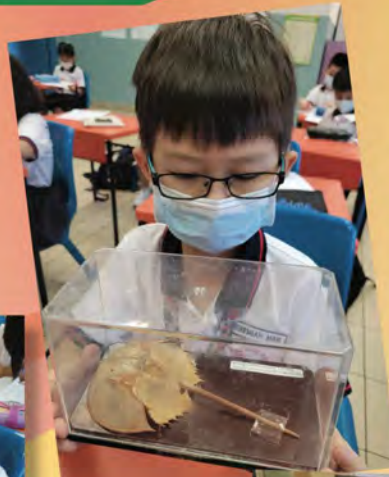
Learning about marine diversity