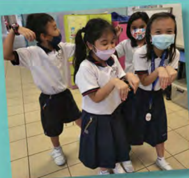
Having fun in the still image activity