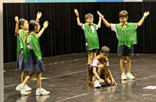
Presenting our eager students in action!