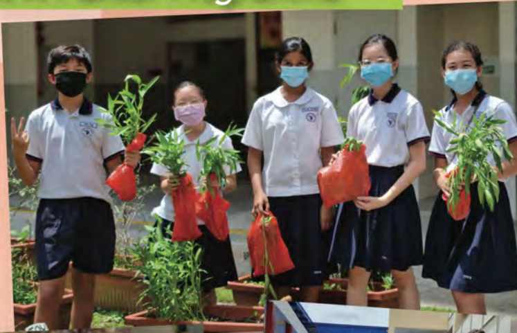
Hooray! It's harvest day!