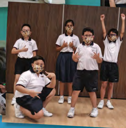
Our NE Ambassadors participating in the annual SCDF Junior Lionheaters Challenge!