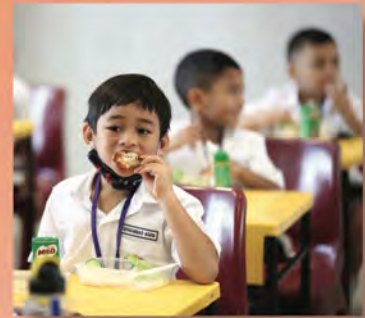
Enjoying the food