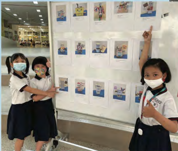
Look at our Cyber Wellness ambassadors!