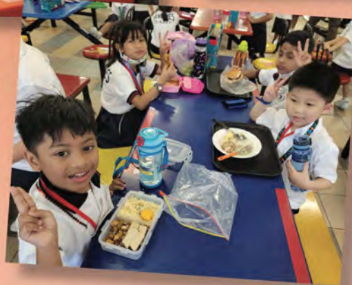
Excitement during recess!