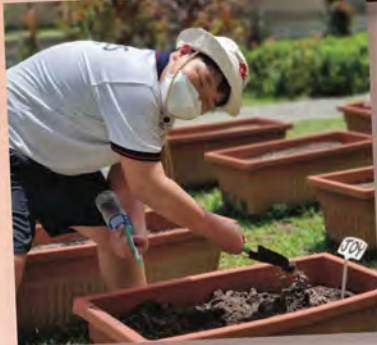
Let's grow some vegetables!