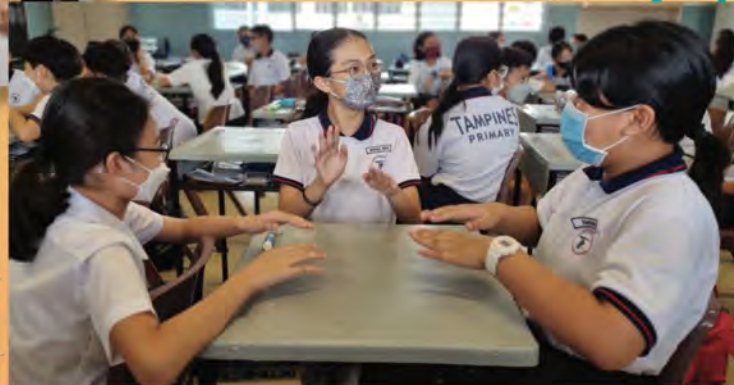
TPPS school cheer creation