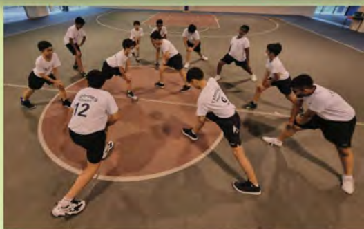
Basketball Senior Boys - Top 8 position

Congratulations to the teams who participated in the National Sports Games!