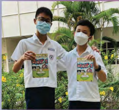
Posing with the publication, Mementoes

Four of our P5 students took part in the Creative Writing Programme (CWP) organised by the Gifted Education Branch last year. The programme aims to nurture budding writers in creative writing by helping them to cultivate a critical awareness of literary techniques and craftsmanship. The students worked extremely hard over a period of three months to put together a portfolio of 5 writing pieces each for submission.