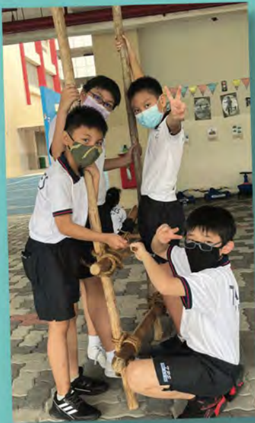
Climbing to the top