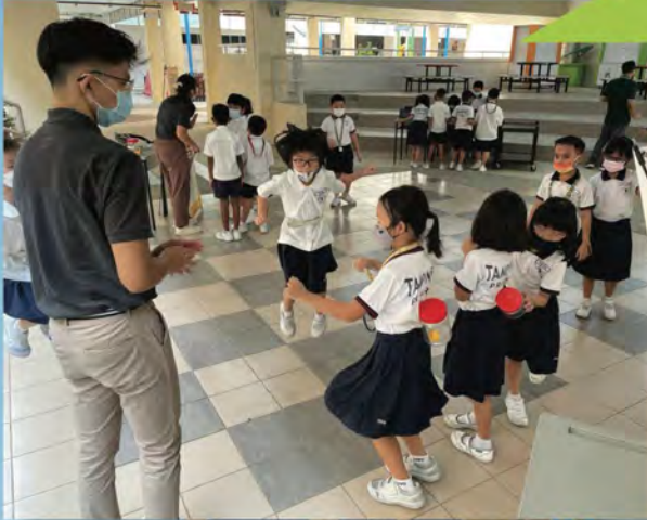
Gotta shake it off!