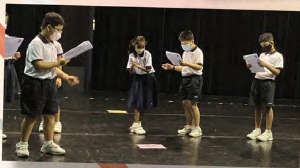
P3 students rehearsing their scripts