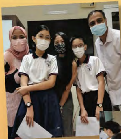
Welcome to TPPS Community Cafe! Here are our NE Ambassadors and NE Coordinators hosting the IFD song dedication

International cooperation remains key in our complex world. By recognising the importance of connectedness between our neighbouring countries, our students can play an active role in fostering people-to-people ties and thus appreciate the region's diversity. Through school-based programmes such as the Community Cafe song dedication and our TPPS School Cheer Creation, our students recognise and celebrate the colourful culture of Asia. They are also given the opportunity to nurture the spirit of friendship and collaboration among peers.