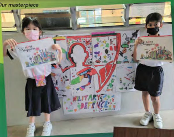
Total Defence Day inter-class collage competition