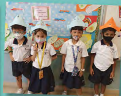
Wearing our self-made Mexican hats... 'arriba arriba ándale', let the music play