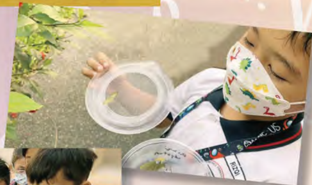
Fly butterfly, fly!