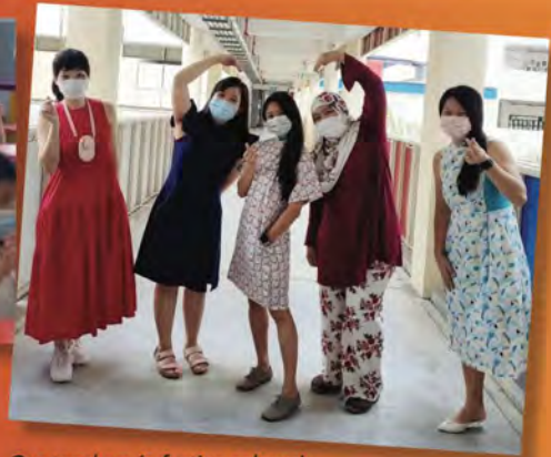
Our teachers in festive colours!

TPPS ushered in the Year of the Tiger with celebrations in the classroom and a concert via Zoom. Our students were engaged in hands-on craft activities and gave back to the society through the yearly Project Hong Bao. Through these activities, our students have a better understanding and awareness of the Chinese culture, promoting harmony in TPPS at the same time.