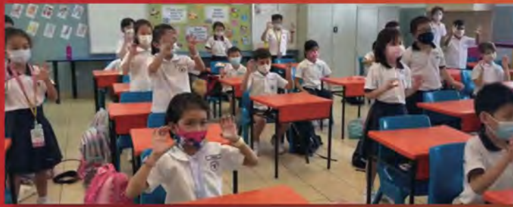
P2 Grrr... Roaring year of the tiger!