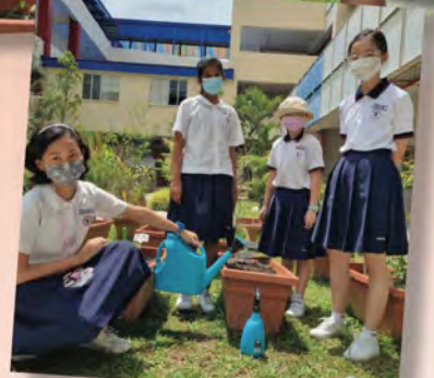
We're all ready to plant