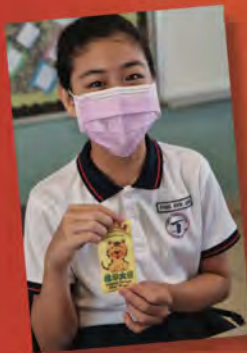
My hongbao design!

Scan to view information and more photos of the programme on your phone