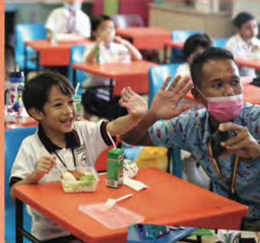
Happy to see his parents on Zoom during the first recess