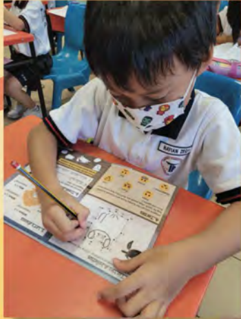
Virtual Changi Biodiversity Walk

P1s embark on this e-learning journey to learn about the environment and relate to places around them. They also learn to understand how their actions can affect the eco-system.