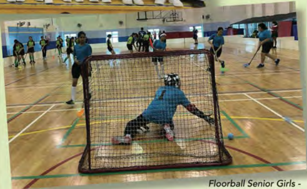
Floorball Senior Girls - 3rd place