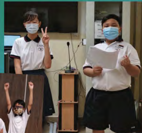
TDD Community Cafe - Our NE Ambassadors sharing about the 6 pillars of Total Defence