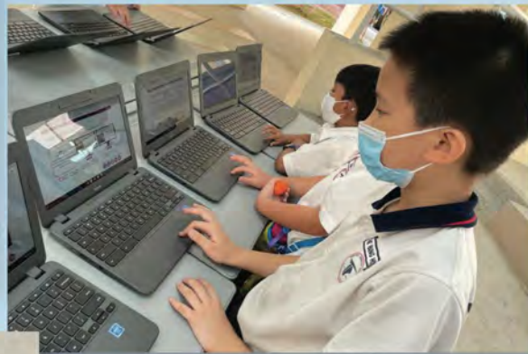
Let's try 'The Fake News' game