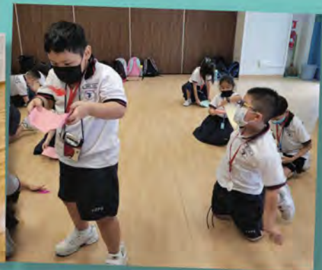
Trying our best not to let the feather fall to the ground