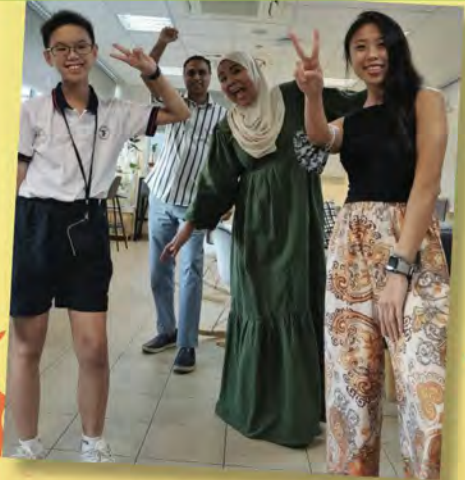
TPPS commemorates International Friendship Day - Singapore in Asia!