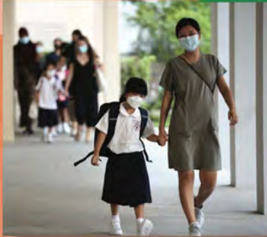
First day of school