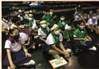
All dressed up for the performance