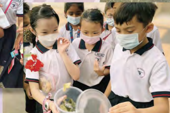
Let it go, let it go...