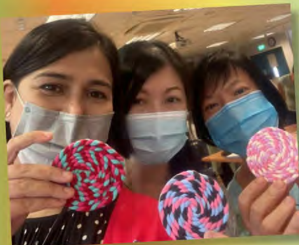
Our completed coasters

Through the upcycling activity, the staff used upcycling techniques to weave, stitch and transform the discarded T-shirts into a functional coaster mat.