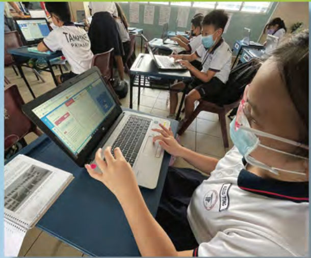
P4 coders at work