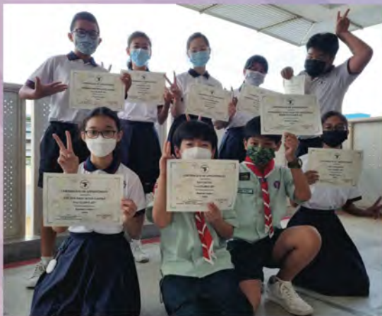
Congratulations to our prefects and CCA leaders!

The Student Leader Investiture is a ceremony to formally officiate the appointments of our prefects and CCA leaders. It is held during assembly as a form of recognition for our student leaders. Through the investiture, we also hope to motivate the other students, especially those in the lower primary, to be aspiring leaders.