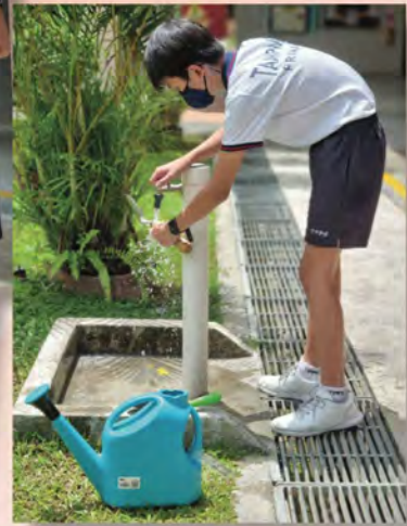
Let's not forget to clean up