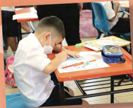
Focused on colouring