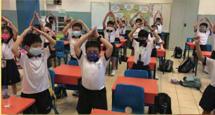
A for Adaptability!