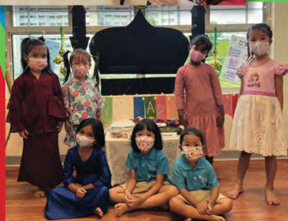
Learning more about Malay culture at the Interest Corner