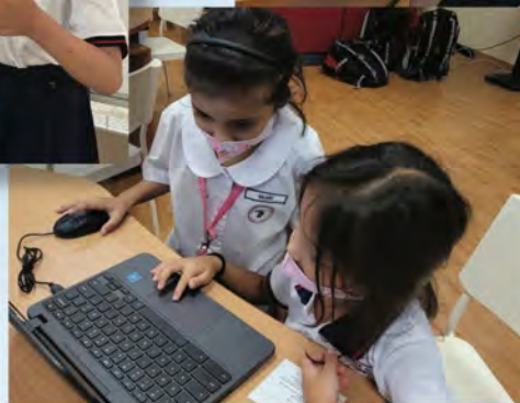
Let me show you how to do it