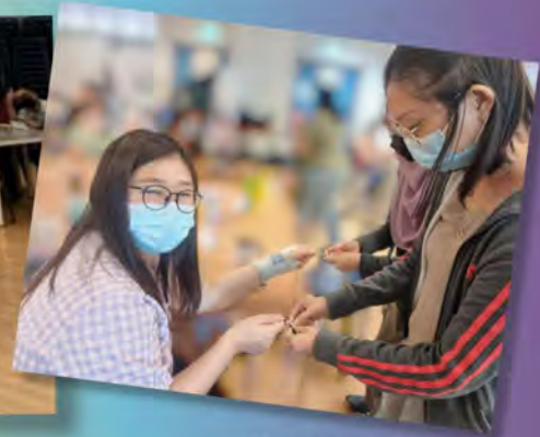
Lending a helping hand!