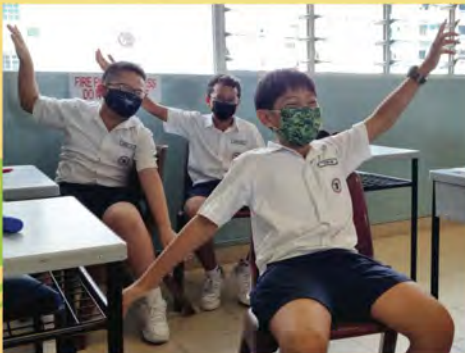
Smiles and laughter from our cheer creation

International cooperation remains key in our complex world. By recognising the importance of connectedness between our neighbouring countries, our students can play an active role in fostering people-to-people ties and thus appreciate the region's diversity. Through school-based programmes such as the Community Cafe song dedication and our TPPS School Cheer Creation, our students recognise and celebrate the colourful culture of Asia. They are also given the opportunity to nurture the spirit of friendship and collaboration among peers.