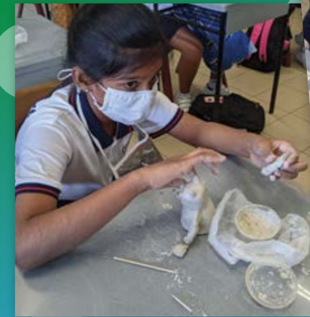
Moulding my creation.