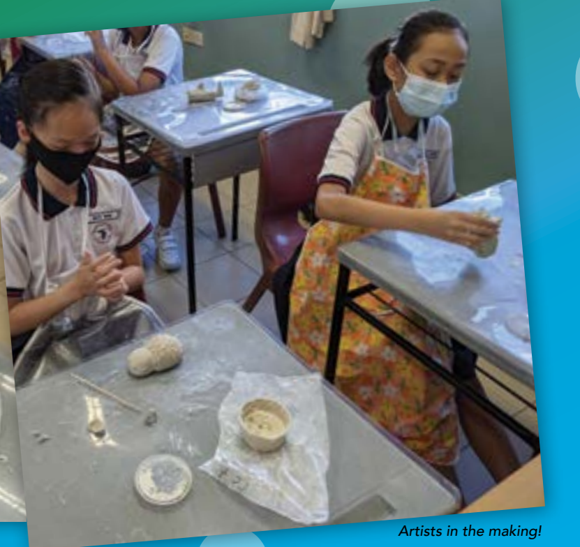
Artists in the making!