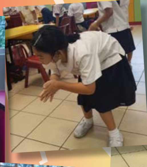
Ha! Getting ready for Choral Speaking lesson