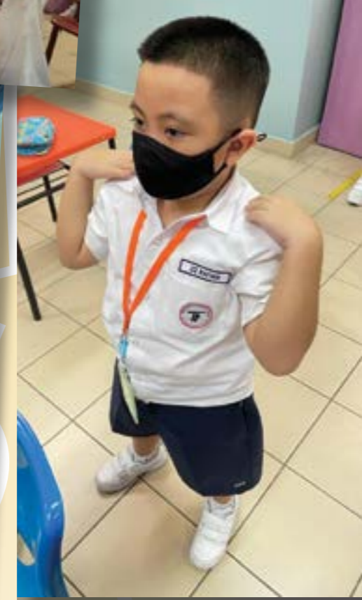
Almost ready for Choral Speaking