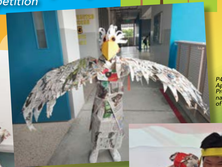
P4 Faith - Apa khabar! Presenting you the national emblem of Indonesia!