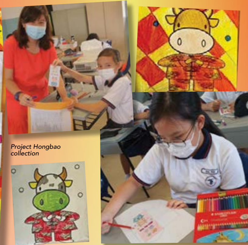
Project Hongbao collection