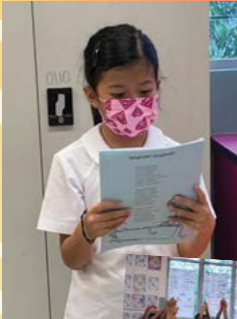
When passion meets excellence