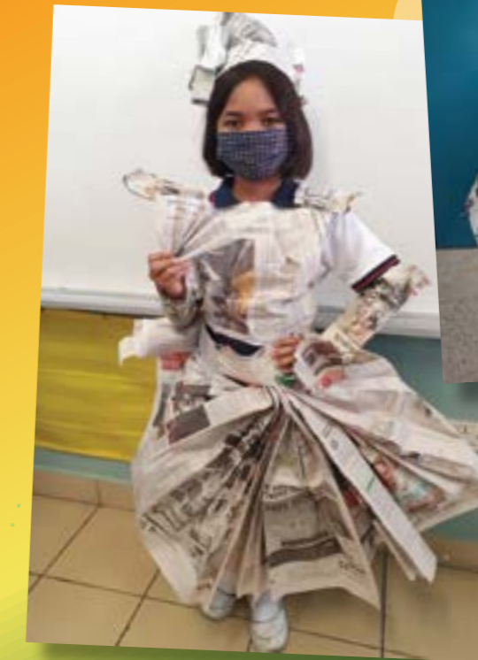
P2 Care - Selamat pagi! Greetings from Malaysia!