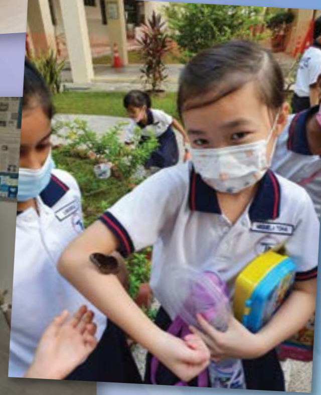
Fly, Fly, Butterfly!