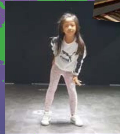
Most popular performance item - Giselle, 1 Faith