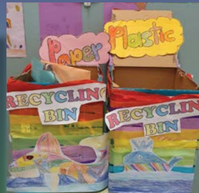
Let's Reduce, Reuse and Recycle!