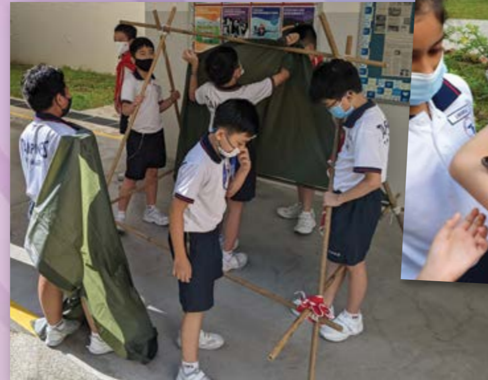
Scouts tent building