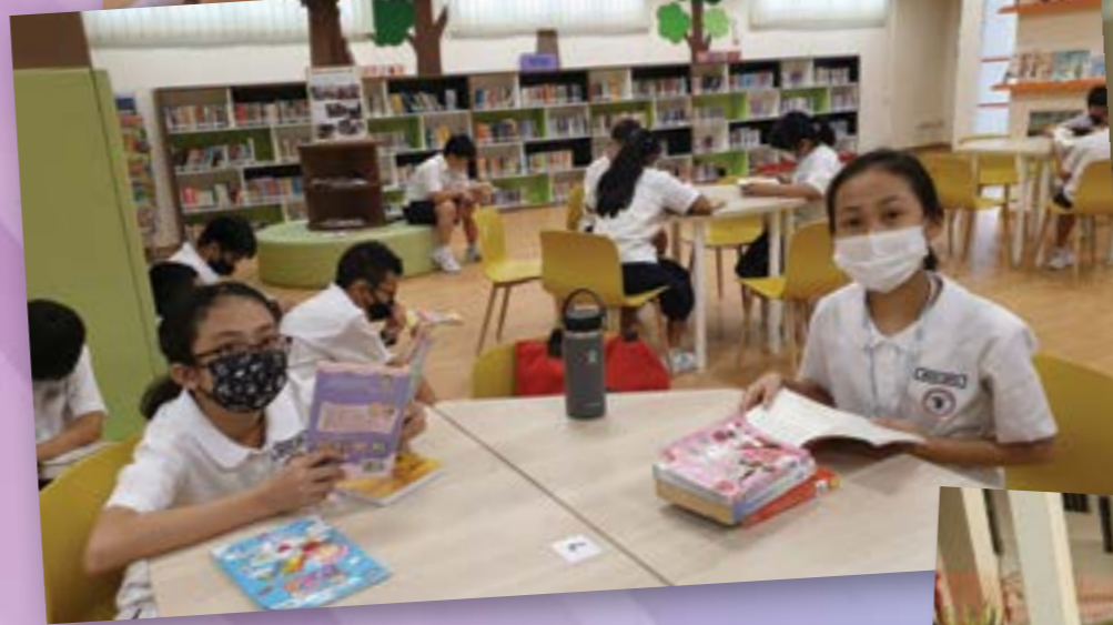
DEAR time - There's always time to read!