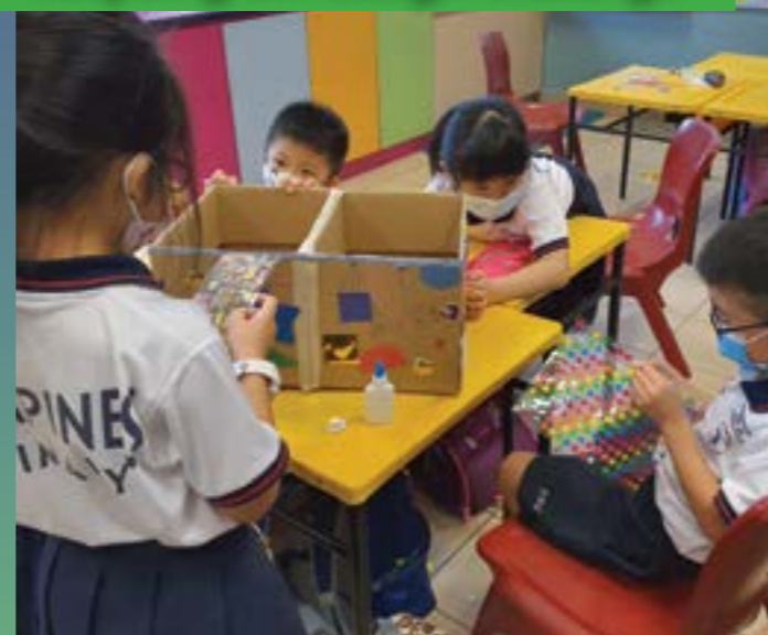
Working together to save our environment!