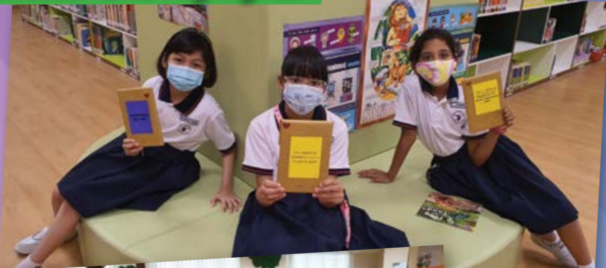
Blind Date with a Book