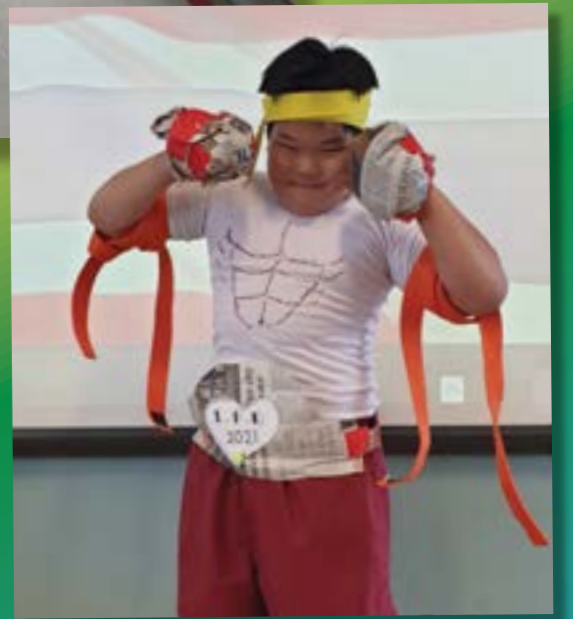
P5 Joy - Sawasdee khrap! Meet the Muay Thai boxer from Thailand!