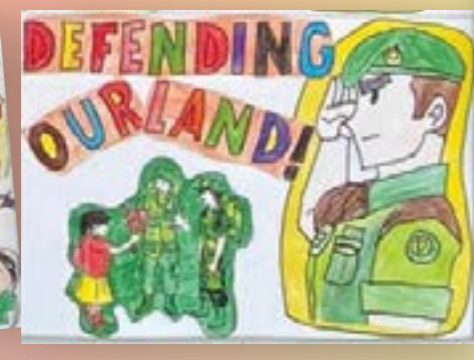
Together We Keep Singapore Strong