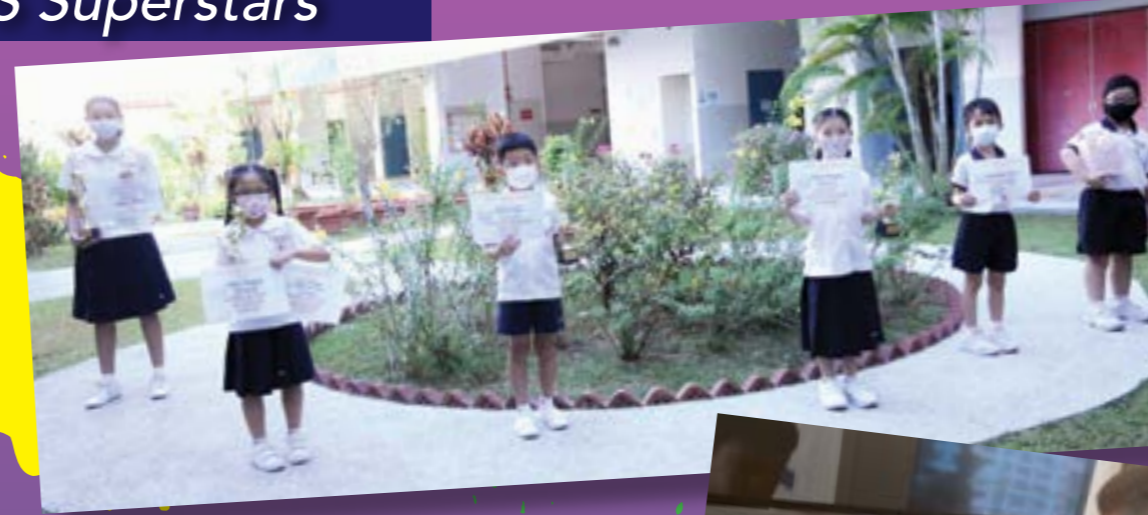
Winners of TPPS Superstars posing for photoshoot