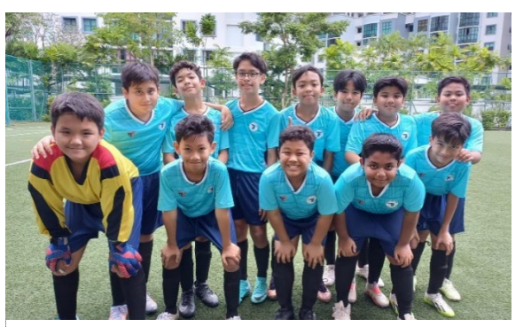
Our Football Senior Boys Team

student athletes from Basketball, Floorball and Football represented the school for the respective NSG games. The NSG is not just a series of competition where students pit their sporting skills against other teams, it is also an excellent platform for the development of character where our students learn values such as, resilience, determination, respect, teamwork and sportsmanship. These enduring values will empower them for future challenges. With this, we wish all our Primary Six athletes a fulfilling and enjoyable NSG experience.