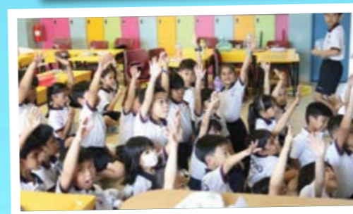
Guess the teacher—the students have all the right answers!