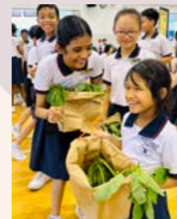
Here's our marketing strategy!