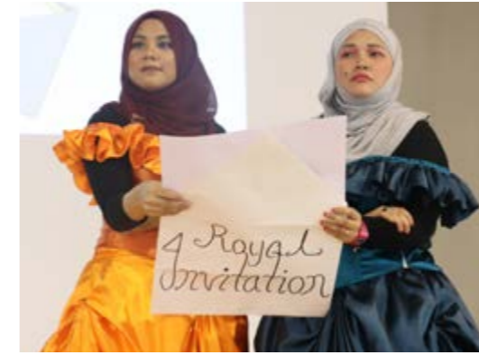
Did you receive the Royal Invite?