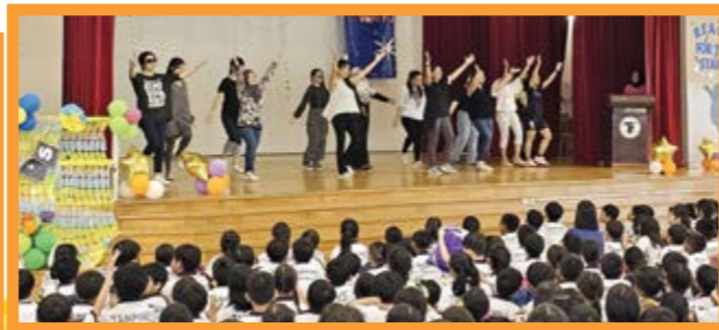
Wonderful performances by our very own teachers