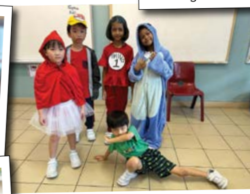
Can you guess our favourite characters?