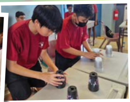
It's harder than it looks!