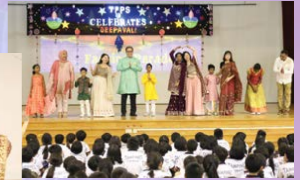
Fashion parade time!

Our Deepavali concert, Joy of Deepavali, was held on 7th November 2023 with the theme being Indian Arts. Arts can be found in every aspect of our lives—from the colours of our costumes, the way our food is presented, our dance forms, our music to even martial arts. The students had the chance to participate in hands-on activities during recess, solving puzzles or drawing Kolam. Many of them were so excited to give henna a try! The