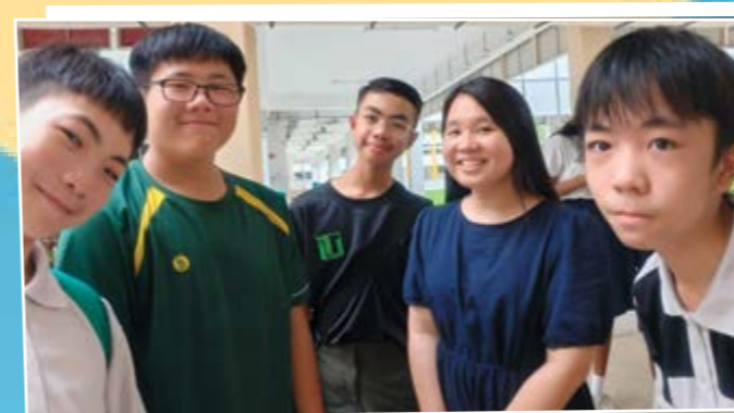
Once a Tampinesian, always a Tampinesian