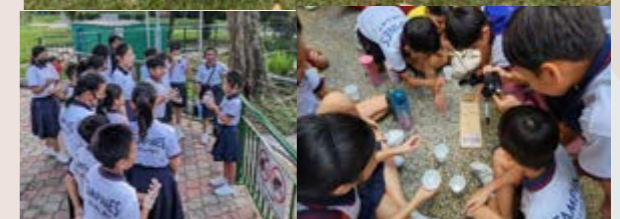
YAS, we can!