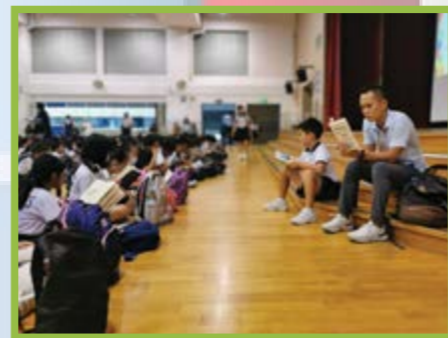
We love to read, especially when it is for a good cause