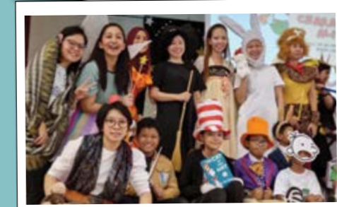
Our teachers do not want to miss out on the fun as well