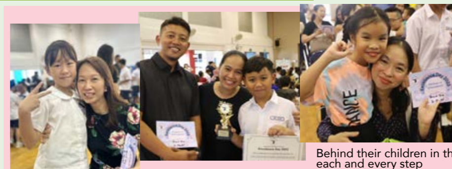
Behind their children in their each and every step