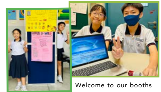
Welcome to our booths

Innovation Day is a platform to showcase the wide variety of student-centric learning activities intended to develop Tampinesians' 21st century competencies in the three domains—effective communication, critical and inventive thinking, and civic literacy and global awareness. This year, we are proud to showcase students' products from Script it Right, Playwriting, I&E CCA, Maker Space, Math Competition, Coding, Sony Creative Science Award and P5 Local Internationalisation Programme. Student leaders were the ones in charge of the various booths, engaging their peers in interesting sharing and discussions.