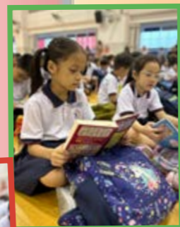
We are serious about reading