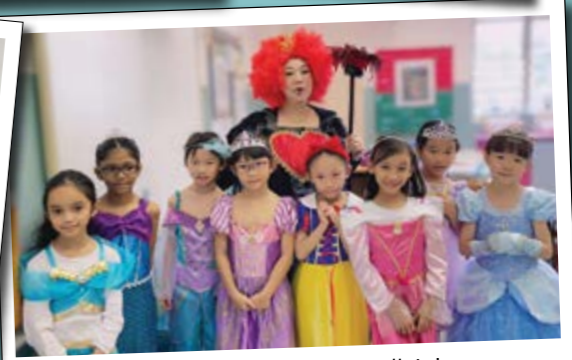
Of princesses and... a villain!