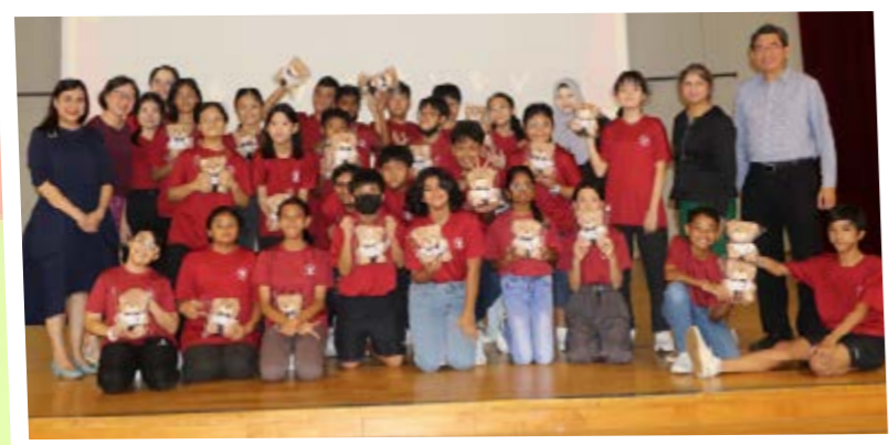
A celebration of our 6-year journey in TPPS

Life did not seem to get less busy for the P6 students after PSLE... in the most fun and exciting way, of course! After all their hard work as they prepared for PSLE, they certainly deserve to let their hair down before they embark on the next leg of their journey in their respective secondary schools. The students valued the time they got to spend with their classmates, bonding over activities like Games Carnival, cup-stacking, learning hip hop dance and going on a learning journey to Singapore Discovery Centre. They even ended their 6-year primary school experience on a high note—Grad Lunch!