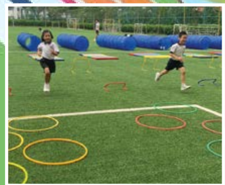
Giving it our all!

The Junior Olympics was conducted in Term 4 where the Prep School students played a variety of sporting activities in a healthy competitive environment, showcasing the skills they had learned during PE lessons. It aims to promote teamwork, positive relationships among peers and the acquisition of the iREAP values.