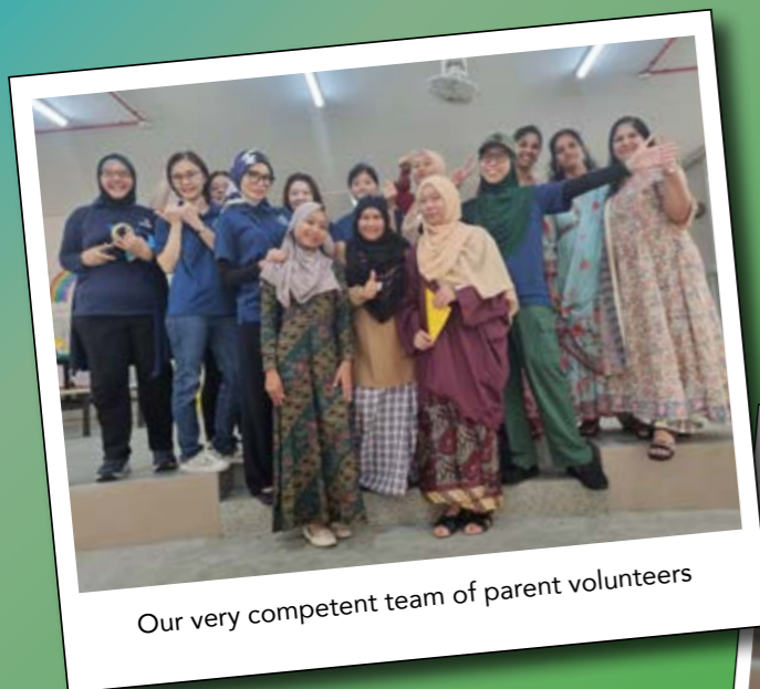
Our very competent team of parent volunteers

The RHD commemorative activities fostered an inclusive environment where appreciation and respect for different cultures were celebrated, leaving a lasting impact on the school.