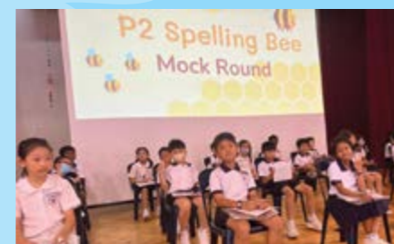
The young contestants getting ready