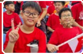
All ready for the show!