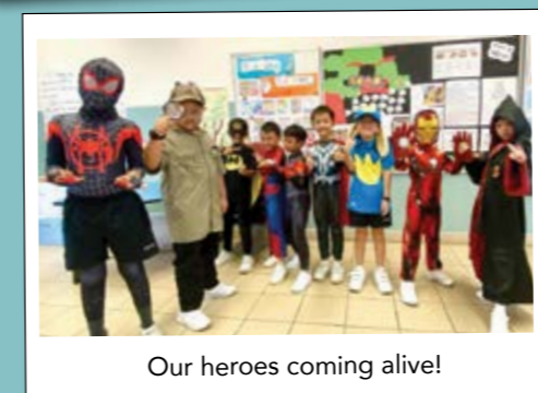
Our heroes coming alive!