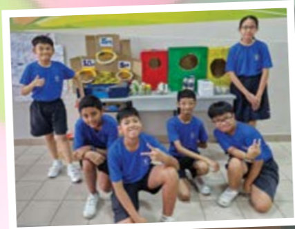
Would you like to give our self-created game a try?