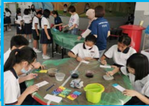
Let's give batik painting a try