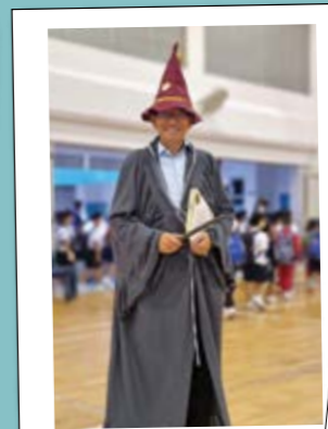
Here are our Hogwarts fans