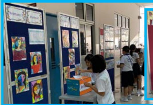
A display of students' 2D art pieces