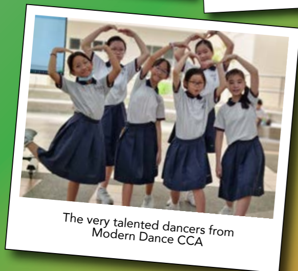
The very talented dancers from Modern Dance CCA