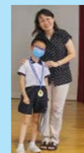
Our P2 super speller