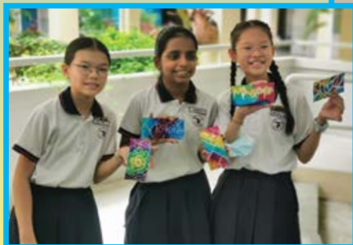
Happy with our end products