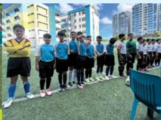
Proud to be part of the team