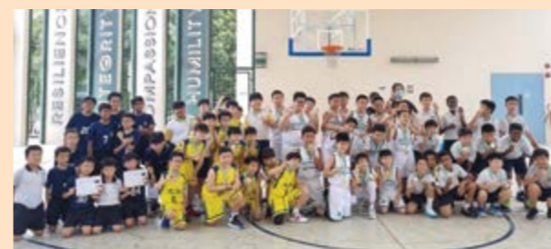
Making friends through sports