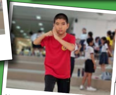
Have you met our wushu master?