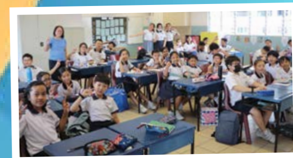
We love our teachers!

Teachers' Day was a joyous occasion at TPPS. The students did everything they could to show their deepest appreciation for their teachers. This year, our student leaders even helmed the classroom segment by being the emcees and running the show in the classrooms so that the teachers could sit back and relax for the day. We also welcomed our alumni back with open arms. They were certainly eager to meet their ex-teachers and celebrate the happy occasion with them.