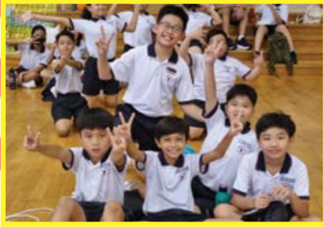
Having a good time during the Sports Carnival

Children's Day was definitely a fun affair for all. The upper primary students had an exhilarating Sports Carnival in the morning and the teachers came together to put up many wonderful performances during the concert in the afternoon. It was a day of many laughs and best moments. While it was a special day for our students, the teachers had so much fun putting together the day's programmes too!