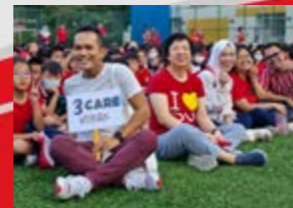
Can't wait for the observance ceremony to start!