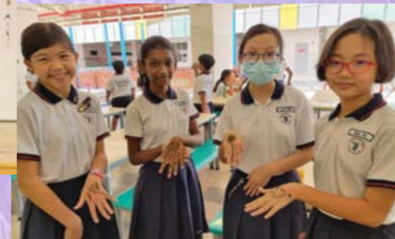
We love the unique henna designs

highlight was, of course, the concert itself. Students, staff and PSG members all came together to contribute in one way or another, be it as a performer or an engaged audience. What a joyful Deepavali!