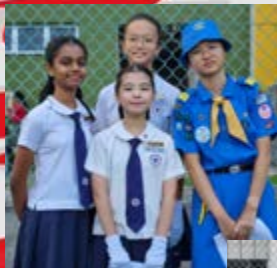
The prefect leaders from TPPS and TPSS working hand in hand