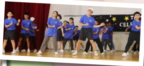
Dancing to our hearts' content