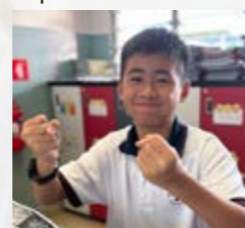
Learning some simple Muay Thai