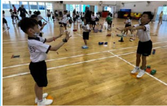
Friendship is more important than winning