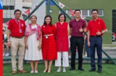
Our school leaders are dressed for the occasion