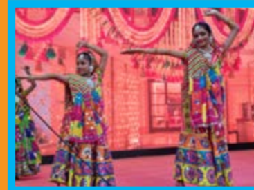
Behind the scenes