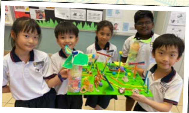
Proudly presenting our masterpieces

P1 students also had the opportunity to learn about different cultural dances and exercise their creativity in performing the dances enthusiastically together. P2 students were introduced to visual arts. The PAL module complements the art lessons in the curriculum and provides the platform for them to extend, reinforce and apply their learning through art projects that were showcased during Aesthetics Week.