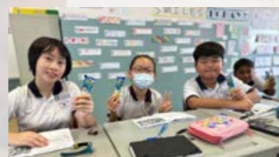
Trying out a Thai snack