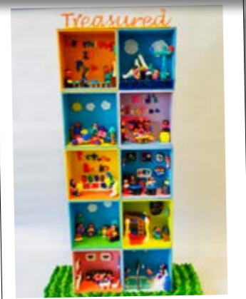
Final artwork titled 'Treasured Memories'