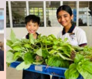
Fruit... no, vegetables of our labour

The P5 students took their knowledge to the next level during the Primary 5 Eco-Stewardship VIA Programme. They delved into the practical aspects of growing plants in both soil and hydroponics. In addition, they ventured into the world of vegetable marketing, learning to find their 'unique selling point' and crafting eye-catching posters to promote their produce within the school community.