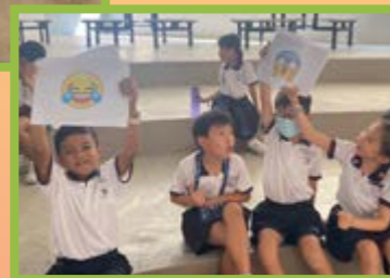
Let's see what the audience think about the performance