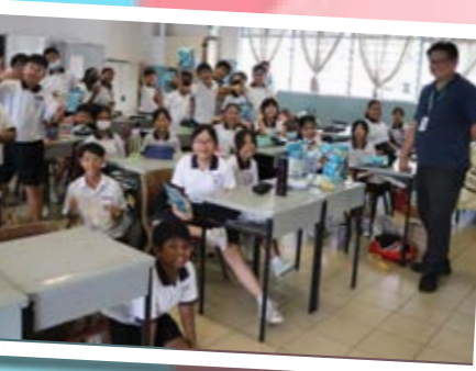
A joyous day for the students as well