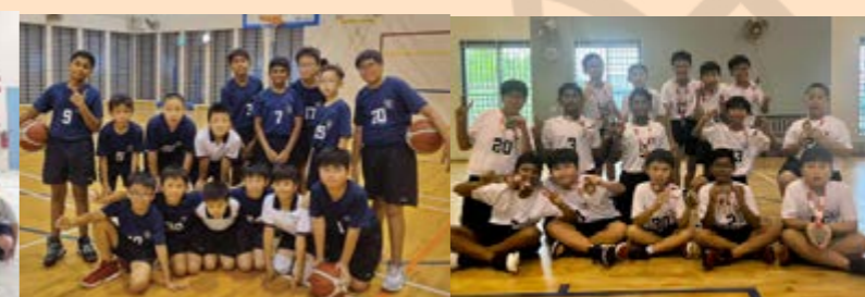
Going through thick and thin together