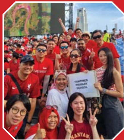
The accompanying teachers who made it possible