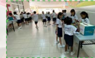
Can't wait to admire their friends' masterpieces

The P2 students completed their PAL Visual Arts Module in Term 3 and had a PAL Visual Arts showcase in August during recess. One selected artwork from each class was showcased and the student artists shared their artwork with pride to their peers. An art appreciation activity was also carried out where all students had the chance to show appreciation for the artwork on display and provide constructive comments to their peers.