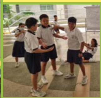
Engaged participants and audience