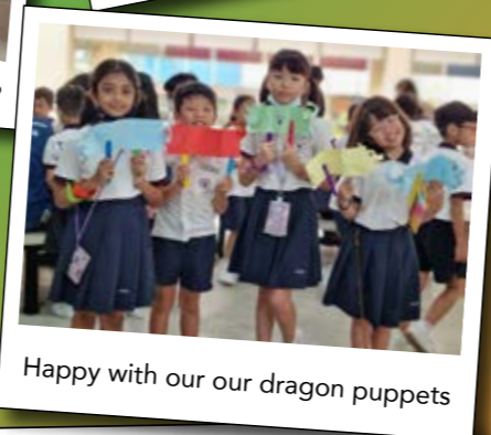
Happy with our our dragon puppets