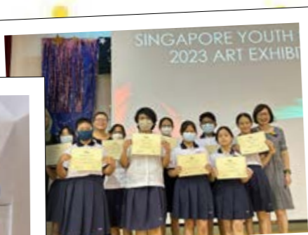
Certificate presentation to our budding artists