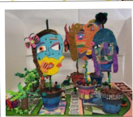
Final artwork titled 'Garden of Emotions'