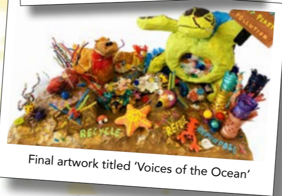
Final artwork titled 'Voices of the Ocean'