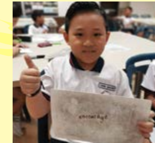
I've got this!