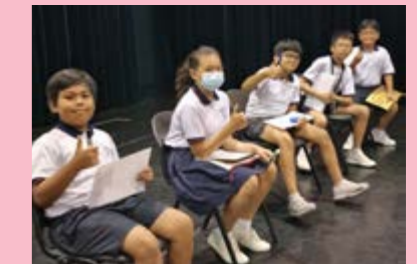
Determined to give it their best shot