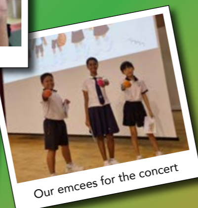
Our emcees for the concert