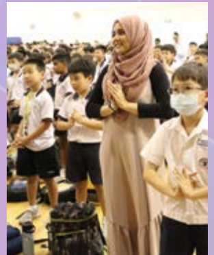
What's a celebration without song and dance