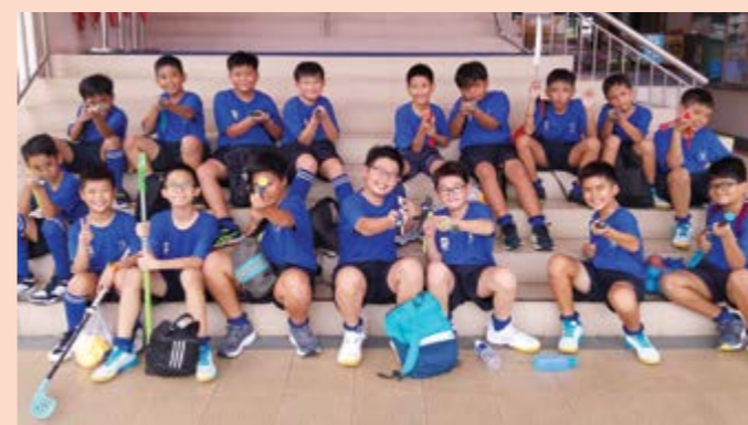
Friendship over competition