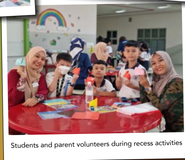
Students and parent volunteers during recess activities