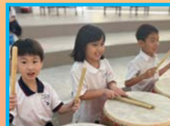
Young drummers in training