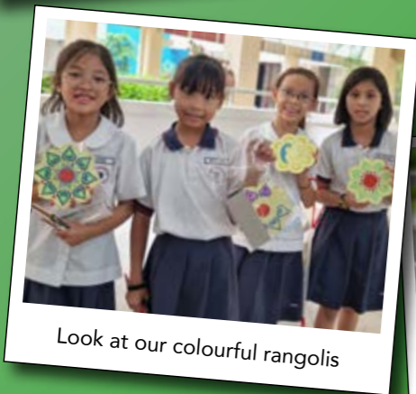
Look at our colourful rangolis