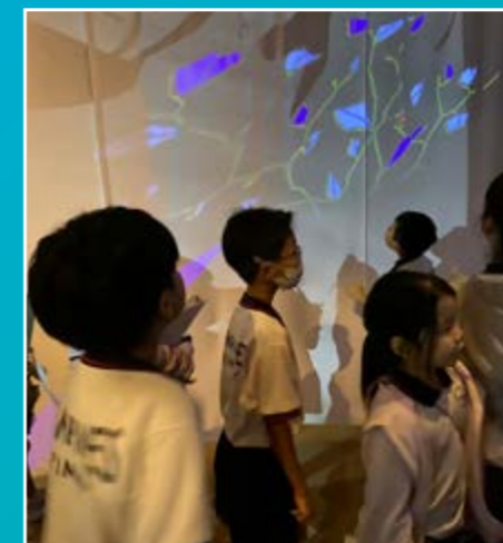
Totally in awe