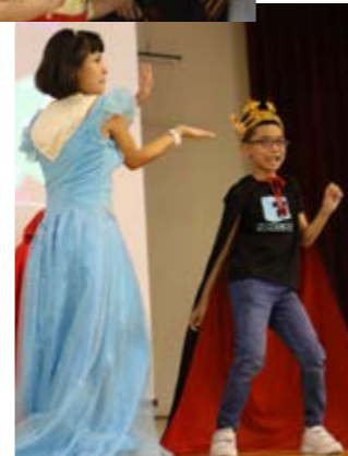
The Royal Dance

The Speak Good English Movement promotes the use of good English among Singaporeans. At TPPS, we continue to raise awareness on the importance of using good English and encourage the use of Standard English, especially in school and for formal situations. Focusing on language appreciation and the use of creative expressions, the SGEM programmes spread over an entire term. The students participated in Spelling Bee competitions and enjoyed an assembly programme put up by our very own teachers. We even came together as a school to read for a good cause in support of the Read for Books charity drive.