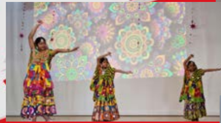
A concert item we are very proud of: The Symphony of Dreams