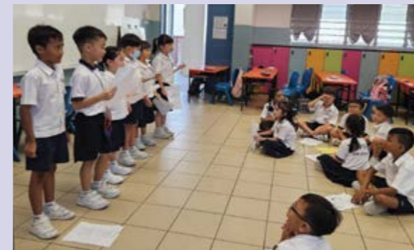
Practice makes perfect