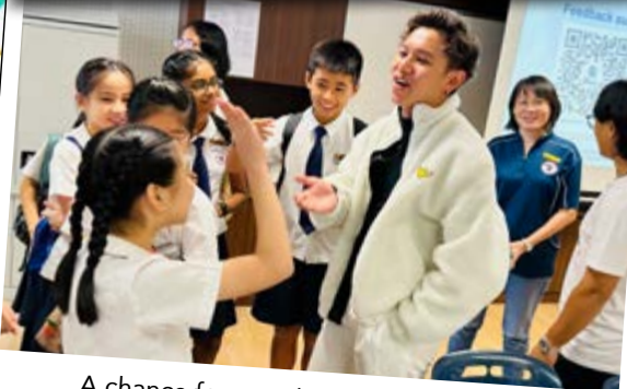
A chance for our alumni to interact with and inspire their juniors