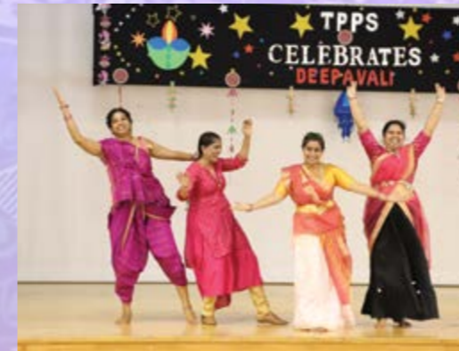
A wonderful performance by our PSG members