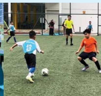
Watch my dribbling skills