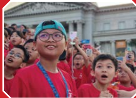
In awe of the Red Lions