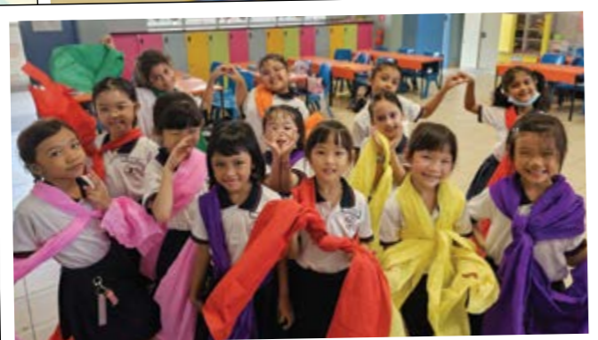
Time for our ethnic dance performance