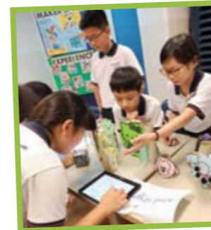
All excited to share our ideas with our peers