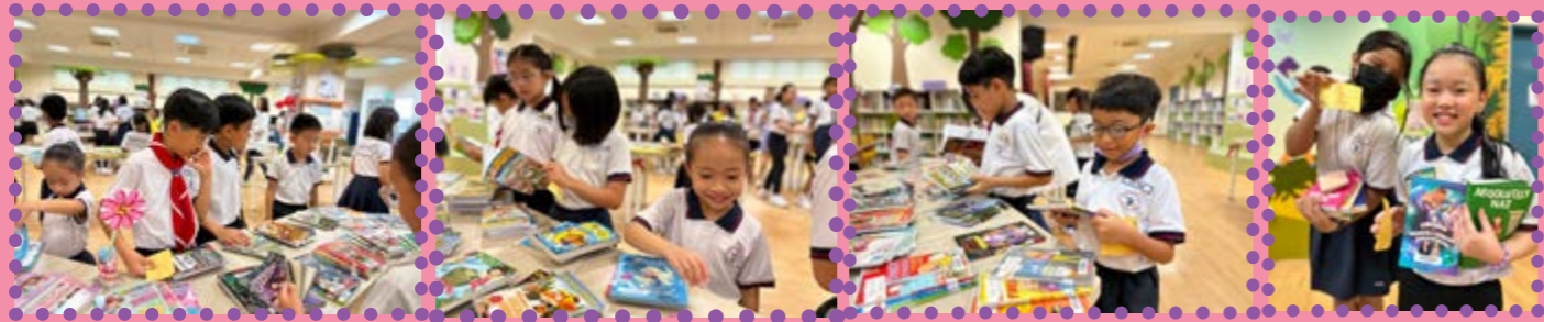
So many books... Which ones do I choose?

Discovery Cove refreshes its collection of books so that the students frequently have something to look forward to in the library. In our recent Book Launch, students who hit a borrowing goal earned the chance to be invited to the exclusive event and be one of the first few to browse the new books. The library was transformed to welcome the students. From their excited faces, it was no doubt that they had had a great time!