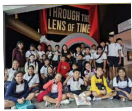
Our final learning journey in TPPS