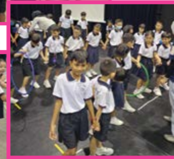
Oh, what fun we had!