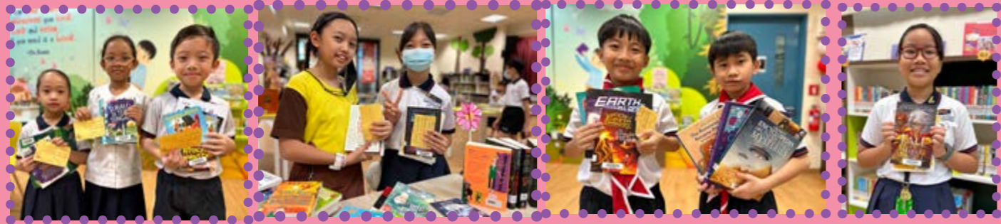
Extremely pleased with our choices!