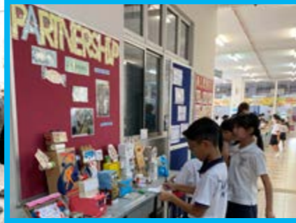
Students showing their appreciation of the 3D artwork