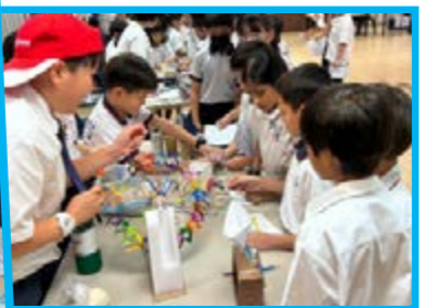
Engaged learning in progress