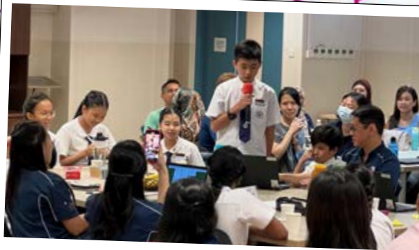
Very engaging sharing by our stakeholders

The In-Conversation with Stakeholders (ICS) event on November 4th was a dynamic platform, fostering meaningful discussions and insights within the Tampines Primary School community. Kicking off with spirited performances by our talented Student Leaders, the event resonated with the school cheer and the melodious voices of our student leaders singing "Let's Build Community". The heart of the event was the small group discussions, where stakeholders engaged in thoughtful conversations, exploring ideas and sharing insights on how to enhance the school's commitment to making every student a creator, connector, and contributor, leveraging EdTech as a capability multiplier. ICS 2023 was a collaborative journey, encapsulating the spirit of "One Hope" as the Tampines Primary School community collectively looks towards a future of growth, innovation, and shared successes.