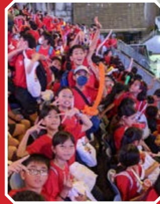
A different kind of MRT ride... extra fun because of our teachers and friends!