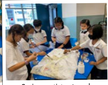
Serious artists at work