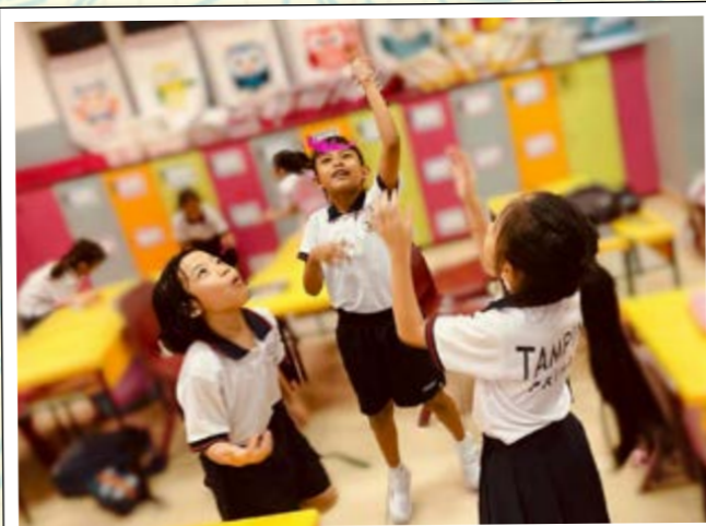
Happiness can be so simple