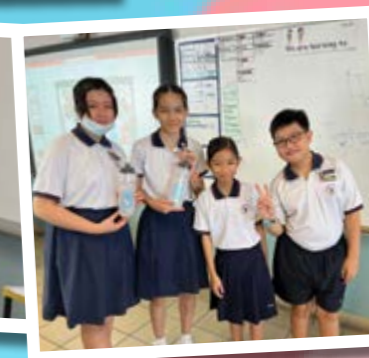
Prefects helping the classroom segment