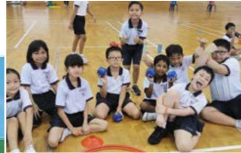
We are happiest when surrounded by friends