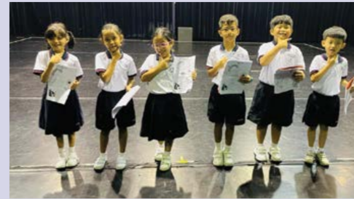
Happily reciting the Happy Poem