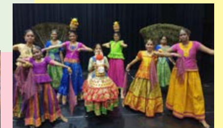
Celebrating their peers' successes with a beautiful ethnic dance