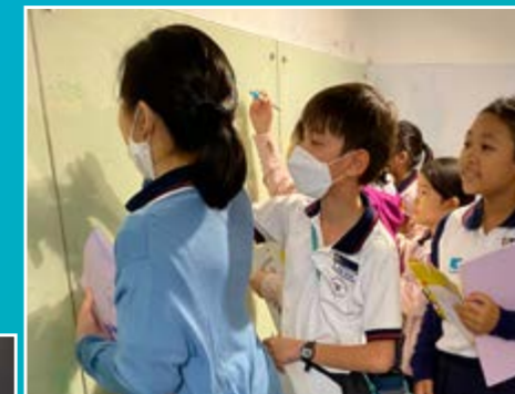
We are artists too!

The Primary 4 students went on a learning journey to National Gallery. They were given the opportunity to discover and interact with the artwork for the Children's Biennale at the gallery. They also learnt more about the museum and selected pieces of artwork by local artists. On top of learning about art appreciation, they also learnt more about Singapore in the past.