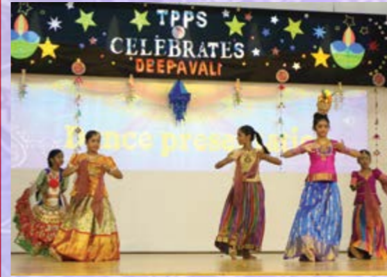
Our students dancing gracefully to the music