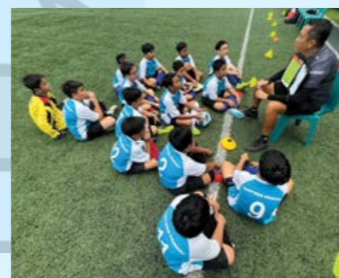
Strategizing in progress