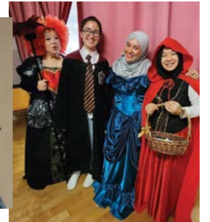
Our very talented teacher-actresses