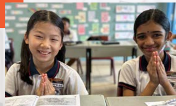
Sawat dee khrup!

The programme was tailor-made such that students could learn specific aspects of the countries, like their food, language and culture, to deepen their experience and gain more knowledge about these countries. Leveraging on the affordances of technology, the students worked together with their overseas friends to discuss and work on a project. How enriching and meaningful is that?