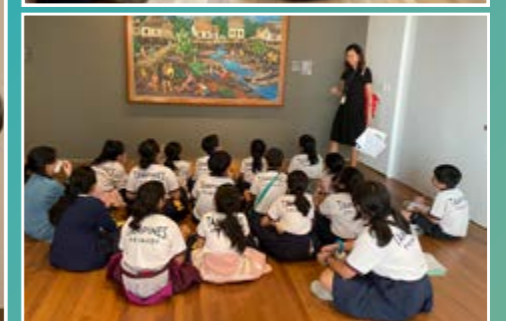
Listening intently to the interesting sharing