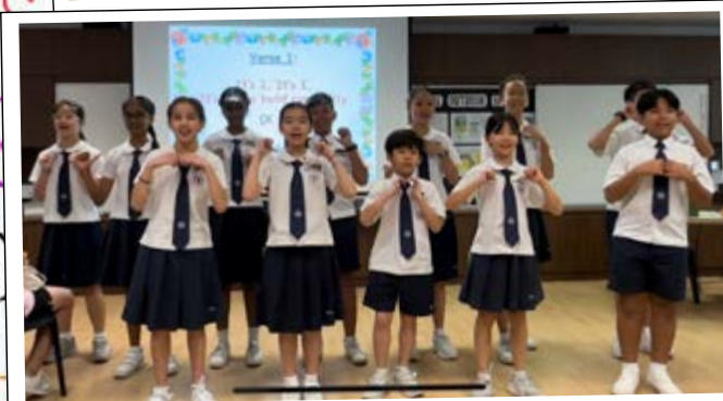
It's WE who build community!