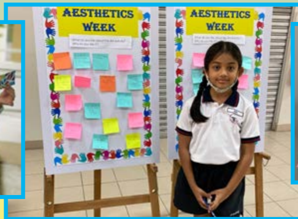
Encouraging the students to share their reflections