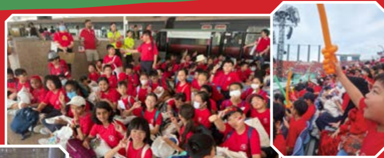
Let's cheer for Singapore!

It was a day of unforgettable moments of unity, vibrant colours and extraordinary performances. From the dazzling mobile displays to igniting the Padang night sky with breathtaking fireworks, the students created unforgettable memories with their teachers and friends as they celebrated our nation's birthday with exhilarating pride. While the students have taken MRT rides on their own before, that chartered train ride they took that day was indeed one that they will remember for a long, long time!