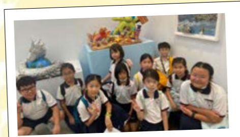
Reflecting on how we did as a team