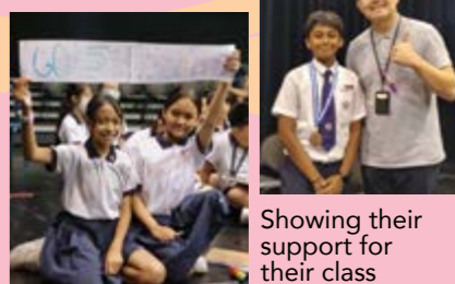
Showing their support for their class