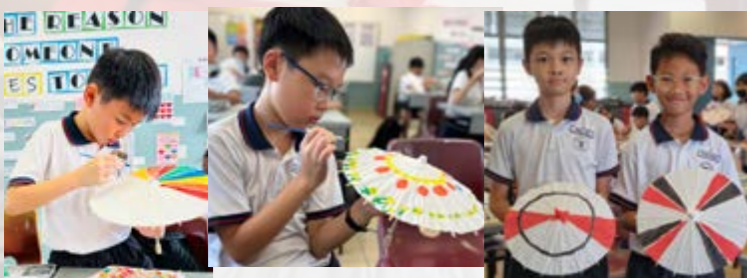
Hands on activity-umbrella making