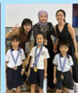
Kudos to our top 3 P1 Spelling Bee champions