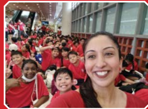
If you are happy and you know it, take a wefie!