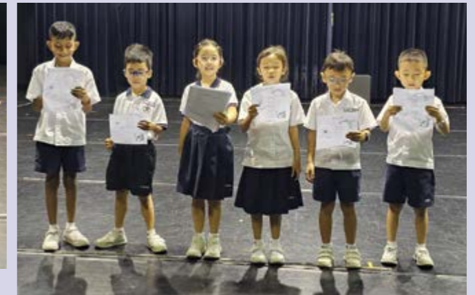
Proud to present our poems