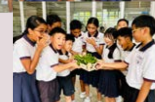
Our pride and joy