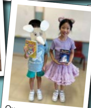
Our very own Geronimo and Thea Stilton