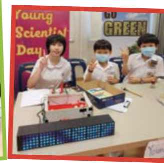
Young scientists at work