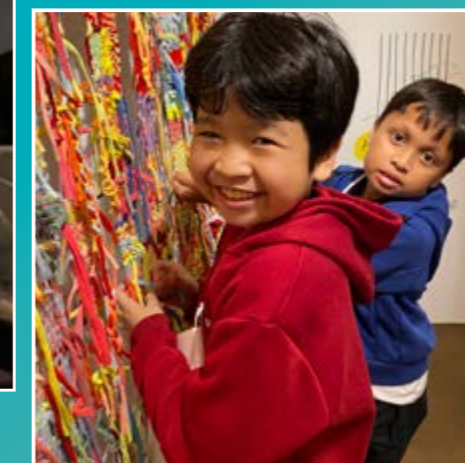
A different kind of art appreciation